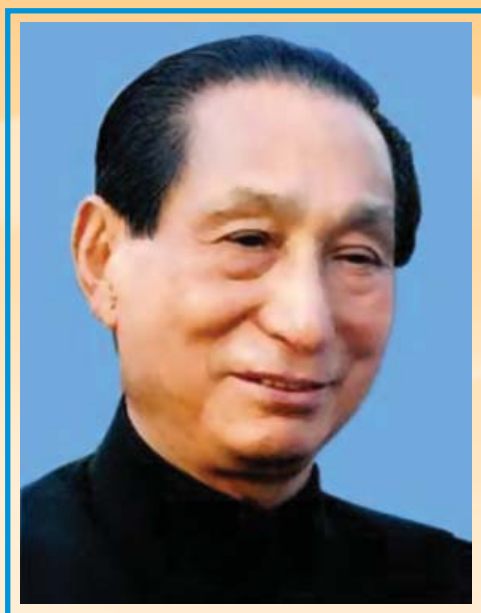
HIS EXCELLENCY SHRI S.C. JAMIR HON'BLE GOVERNOR OF ODISHA