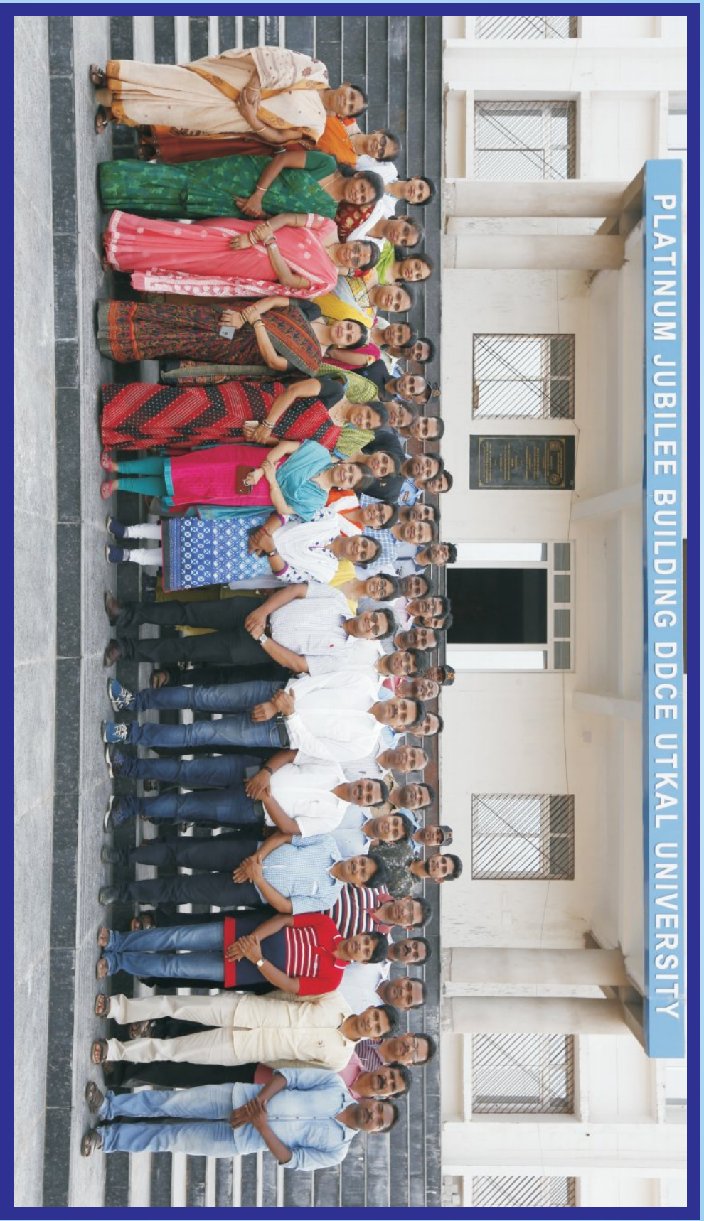
(Team DDCE, Utkal University)