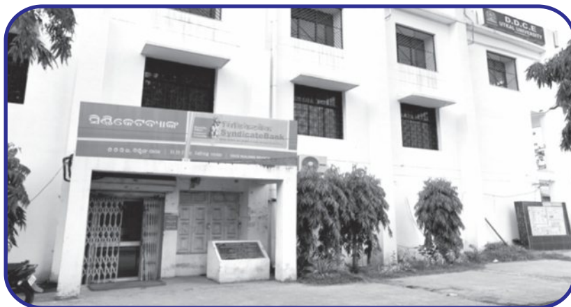
Syndicate Bank, DDCE Campus Branch

In the event of a student loosing his/her University Registration Card, he/she should immediately lodge a FIR in the nearest Police Station. He/She should apply through the College for issue of duplicate Registration Card with a prescribed fee. The application form will be available in the University counter. The application form must accompany a copy of FIR and prescribed fee and the same should be sent to the Controller of Examination, Utkal University by Speed Post/Registered Post.