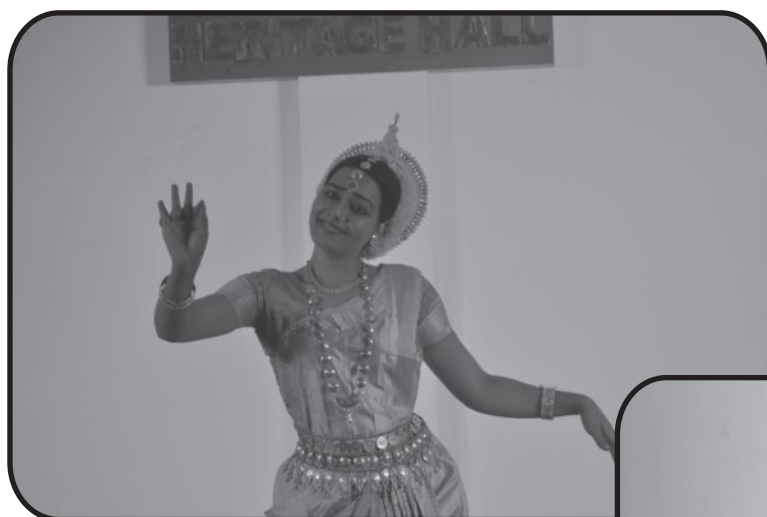
CULTURAL PROGRAM AT DDCE