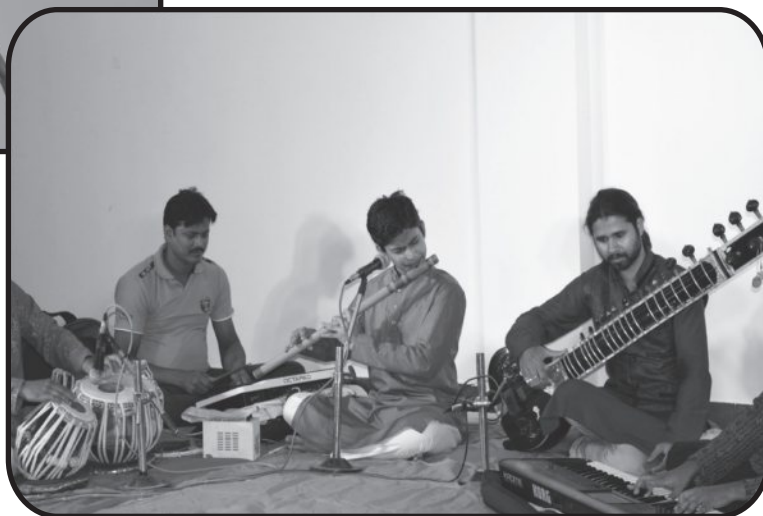
CULTURAL PROGRAM AT DDCE