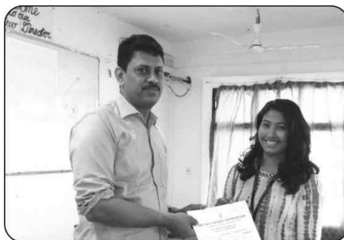
Distribution of SSDC Certificate to the Management Students by Director, At DDCE.