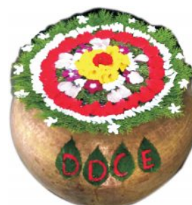
(Flower Decoration at DDCE, Utkal University)