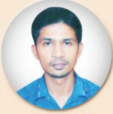
Mangaru Mundagadia Supportive Staff