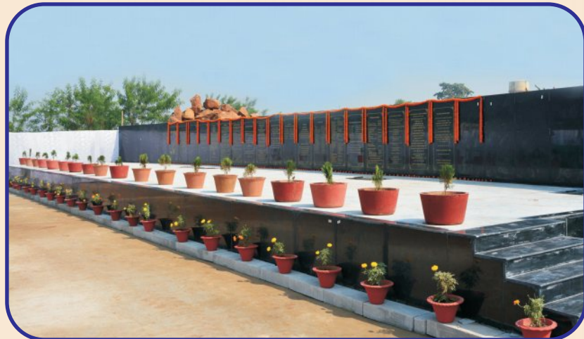
DDCE Shree Mandap